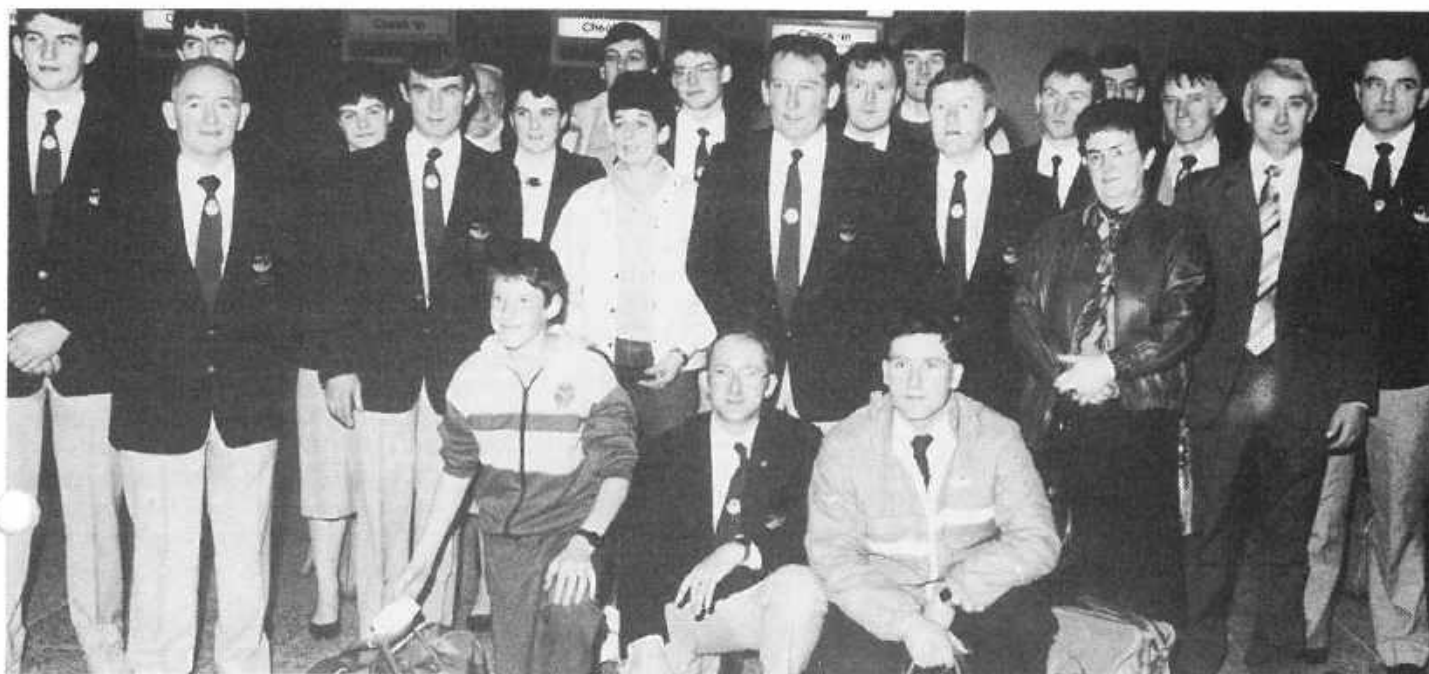
The Irish Party travelling to Australia